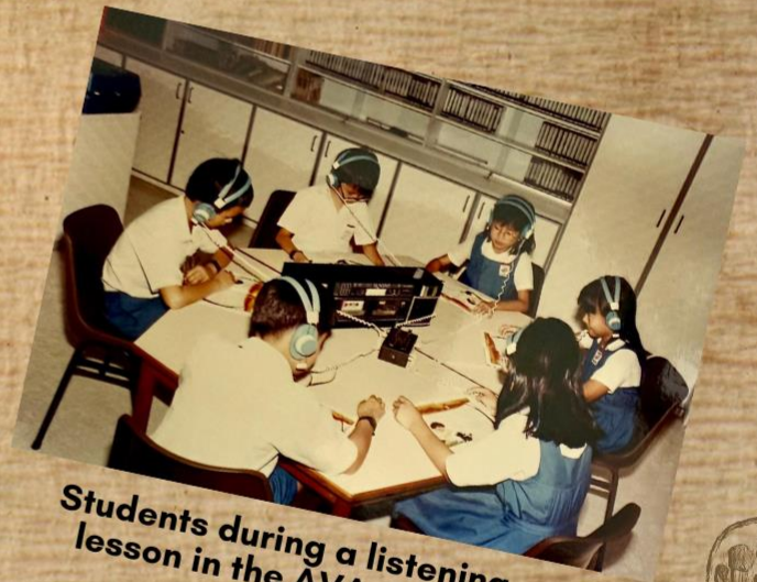
Students during a listening lesson in the AVA room.