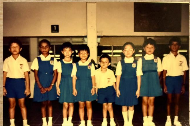
Jieminites looking smart in their school uniforms.