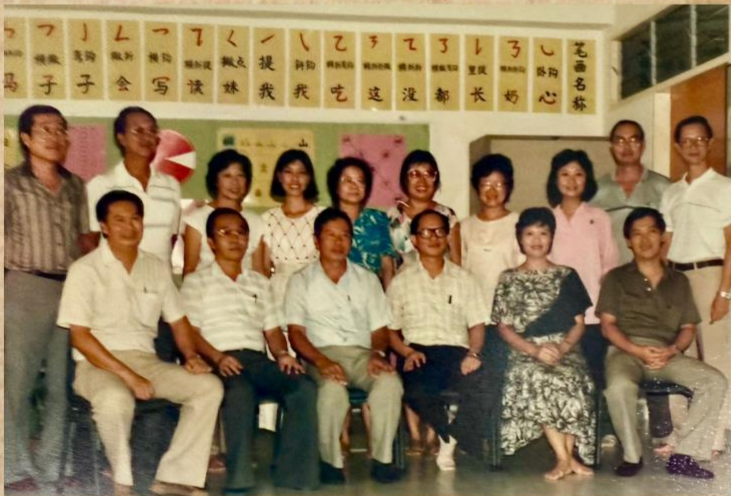
A photo of Jiemin Primary teachers in 1987.